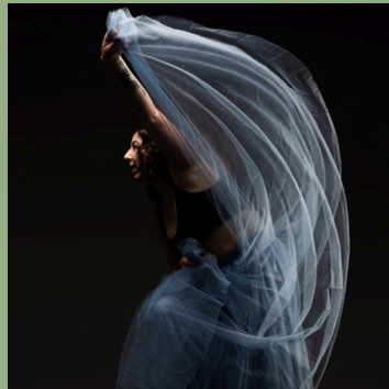
KAYLEE WEBER CONTEMPORARY